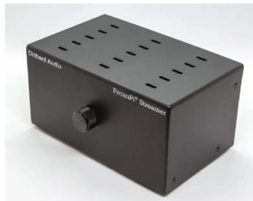
▲ A small black box with an audio monster inside

Driving the PecanPi is Volumio, a popular interface amongst audiophiles. It can accept a number of different services such as Spotify or SoundCloud. In our tests it spotted our local Plex DLNA server immediately and we were playing music without delay. Such is the dedication to pure sound that Bluetooth and wireless LAN are unavailable because the radio interference is unwanted. The PecanPi demands a wired Ethernet connection, and nothing else.